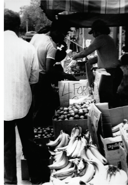
Title: "KENSINGTON MARKET" Category: Photo Journalism Description: Toronto neighborhood