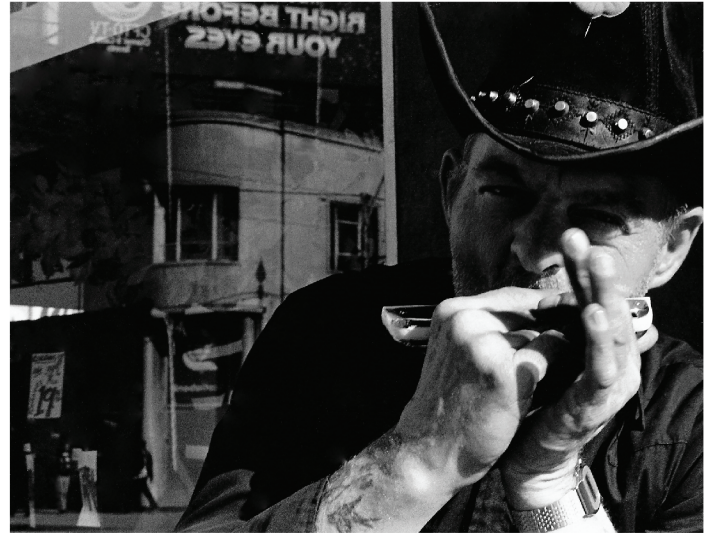
Title: "BUSKER ON YONGE" Category: Photo Journalism Description: downtown Toronto street life