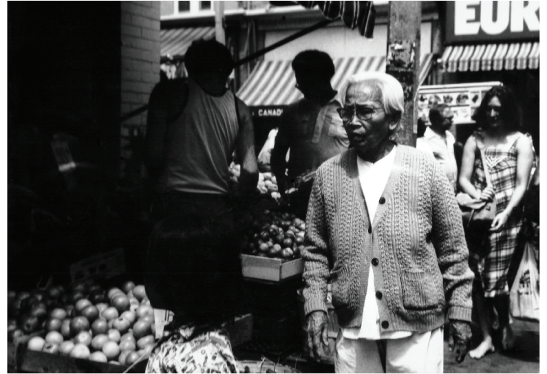
Title: "KENSINGTON MARKET" Category: Photo Journalism Description: Toronto neighborhood