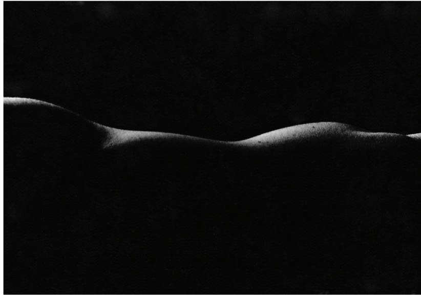
Title: "BODY AS SCULPTURE" Category: Photo Journalism Description: the nude body as art