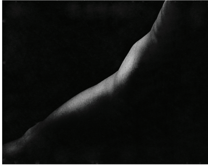
Title: "BODY AS SCULPTURE" Category: Photo Journalism Description: the nude body as art