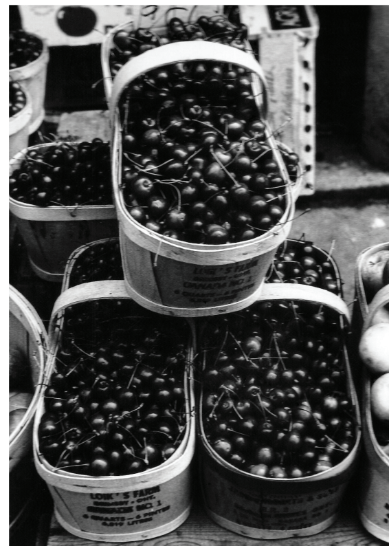
Title: "KENSINGTON MARKET" Category: Photo Journalism Description: Toronto neighborhood