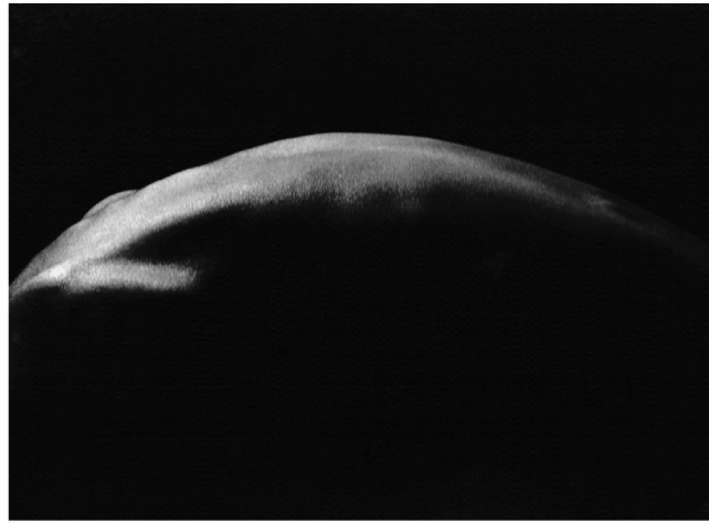
Title: "BODY AS SCULPTURE" Category: Photo Journalism Description: the nude body as art