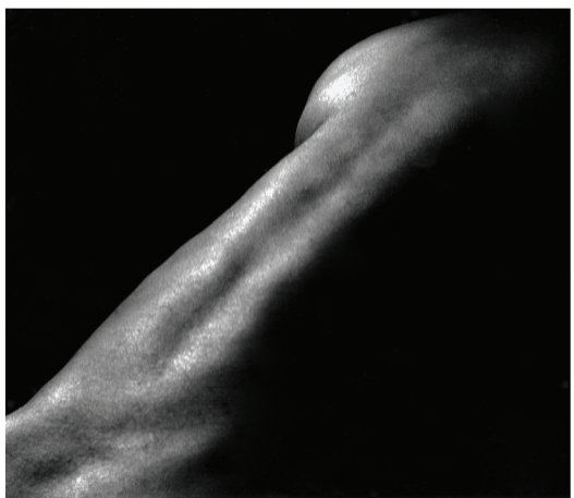
Title: "BODY AS SCULPTURE" Category: Photo Journalism Description: the nude body as art