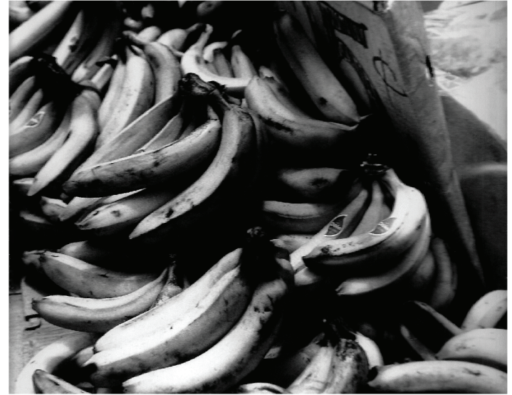
Title: "KENSINGTON MARKET" Category: Photo Journalism Description: Toronto neighborhood