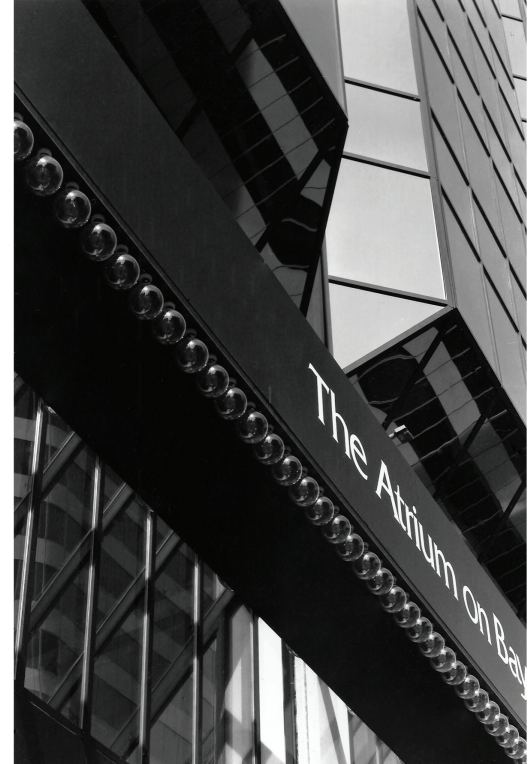
Title: "THE CENTRE" Category: Photo Journalism Description: architectural design